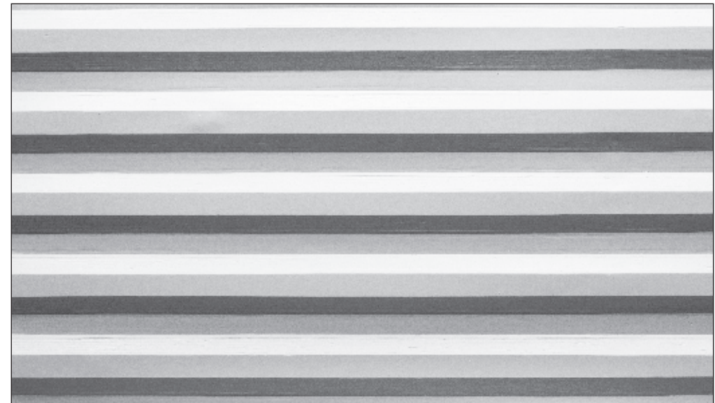
PE 716 Container Sides 5 Bars Panel Size 2390mm x 1200mm x 30mm

Standard designs made in vac formed plastic 0.5mm P.V.C., 1.5mm A.B.S. or G.R.P. (glassfibre)