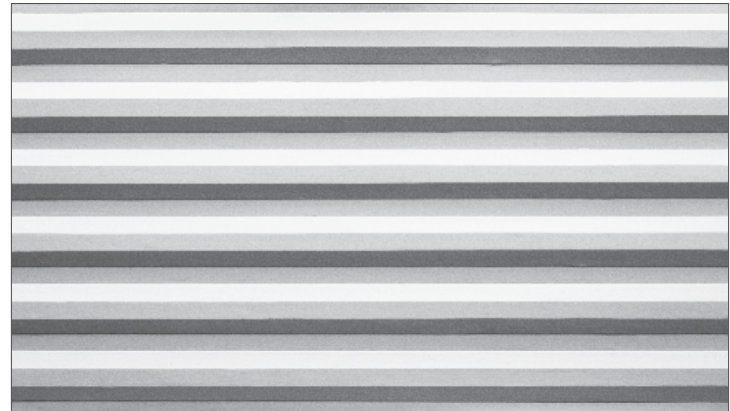
PE 715 Container Sides 6 Bars Panel Size 2390mm x 1200mm x 25mm