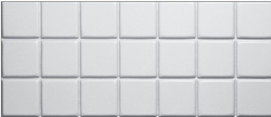
S 111 Squares 300mm x 300mm x 25mm Panel size: 2120mm x 906mm x 25mm