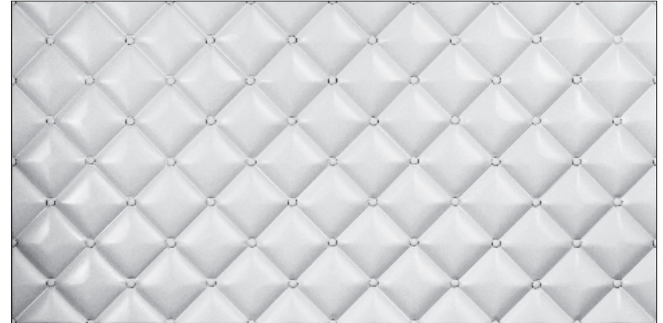
D 101A Diamond with Studs Panel size: 2365mm x 1182mm x 40mm Studs Supplied Separately