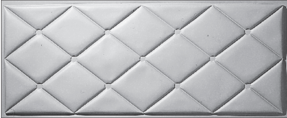
PE 122 Diamond Cushioned effect Panel size: 2140mm x 830mm x 50mm