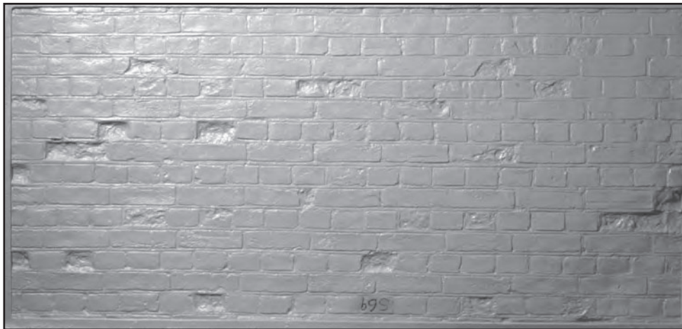
S 69 Eroded English bond Brick size: 220mm x 60mm Panel size: 2270mm x 1040mm x 25mm