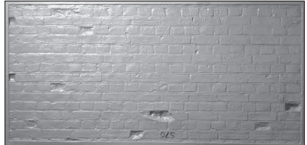
S 70 Eroded English bond Brick size: 220mm x 60mm Panel size: 2270mm x 1040mm x 35mm S69C Corner Available, Fits S69 & S70 1040mm x 240mm x 240mm

Standard designs made in vac formed plastic 0.5mm P.V.C., 1.5mm A.B.S. or G.R.P. (glassfibre) High Strength Plaster backed with hessian scrim for use in pubs and themed areas also available